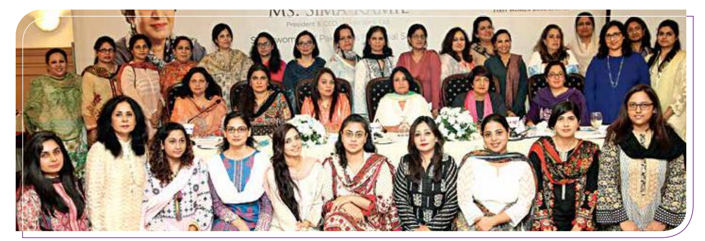
Group Photograph with FWBL Team