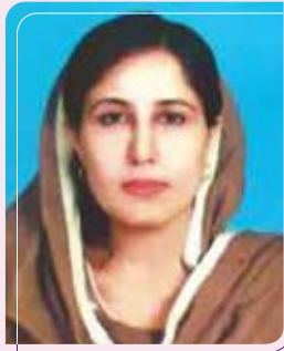
مس نطل جنت، نیچر مال برانچ پشاور دوسری پوزیشن